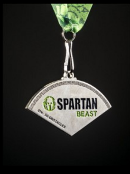
Spartan Beast finisher medal, wedge, and lanyard