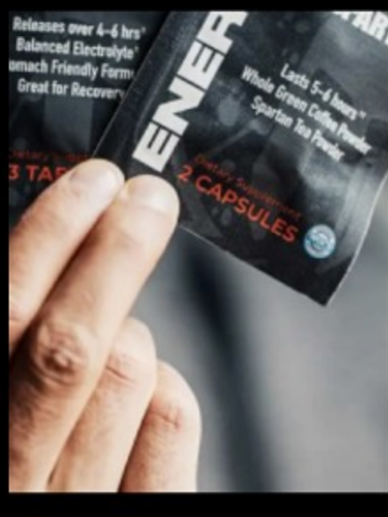
Hydration and recovery nutrition