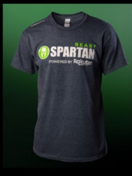
Spartan Beast finisher t-shirt

Every Beast medal you earn is worth proudly displaying, and even handing down to your grandchildren. Your Beast medal also comes with a special magnetic wedge that fits together with the Sprint, Super and others to form the coveted Spartan Trifecta.