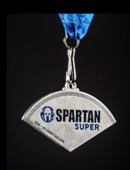
Spartan Super finisher medal, wedge, and lanyard