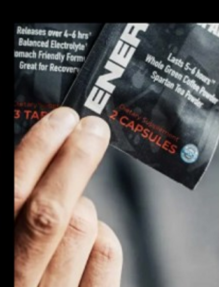
Hydration and recovery nutrition