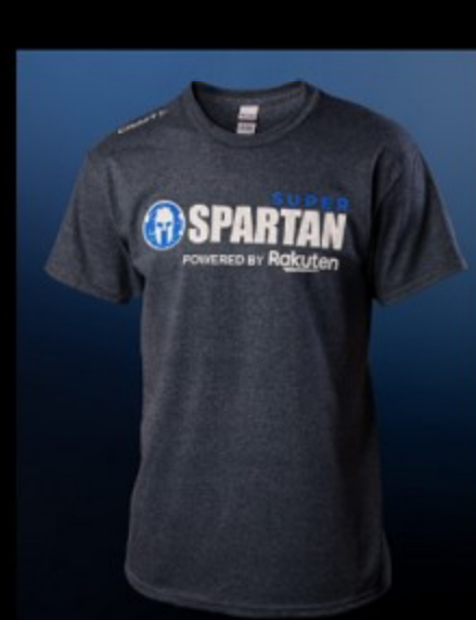
Spartan Super finisher t-shirt

Many medals are tossed in a drawer, but not these. Spartan medals are earned, not given. Your Super medal also comes with a special magnetic wedge that fits together with the Sprint, Beast and others to form the coveted Spartan Trifecta.