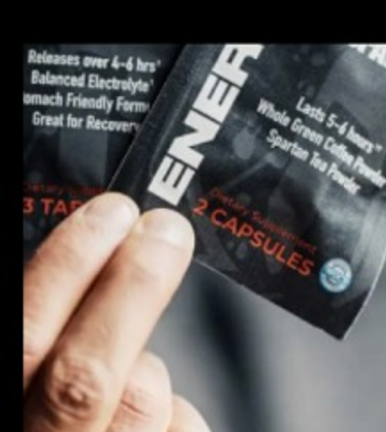
Hydration and recovery nutrition