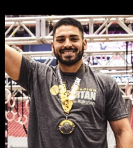
Spartan Stadion finisher t-shirt

You'll be instantly recognized by other Spartans with Stadion's unique collectible yellow swag, including a special medal and shirt. The Stadion wedge can be used in place of The Sprint to create a rare Trifecta.