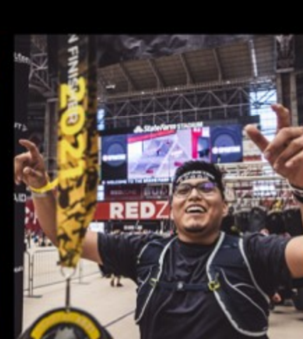
Spartan Stadion finisher medal, wedge, and lanyard