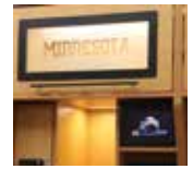
ACRYLIC DOOR PANELS AND LCD SCREEN READY