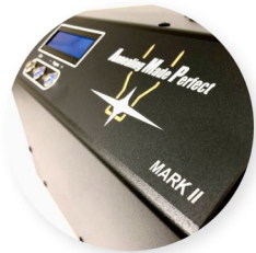
Annealer US$1395 including shipping