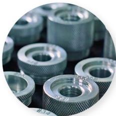
Pilots From US$19.95