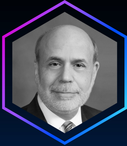
D R . B E N B E R N A N K E

Chairman, The Federal Reserve System (2006-2014)