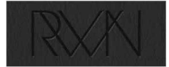
BACK PATCH -black leather quality -debossed artwork -size: 2.75" x 1.125"