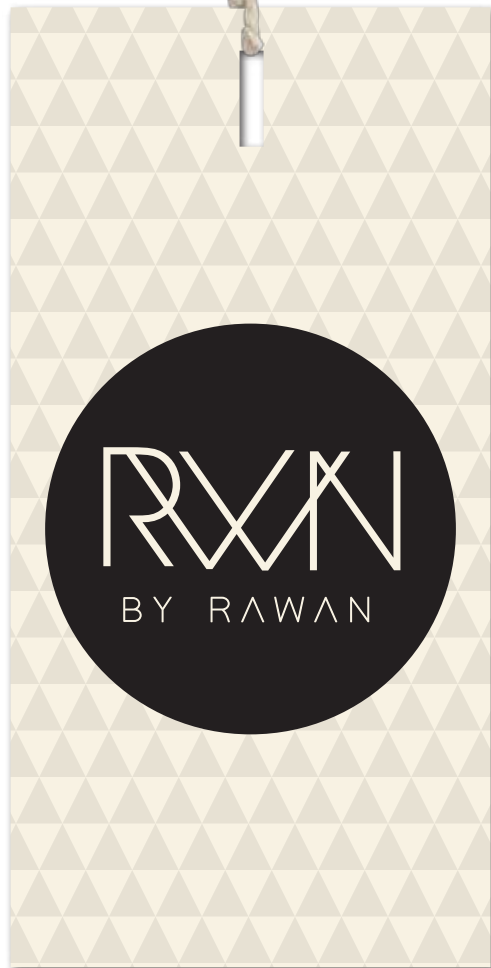
BOTTOMS HANGTAG 2.5" x 5"