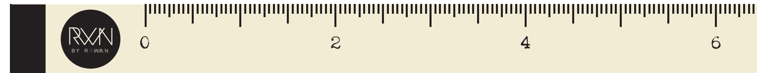
MEASURING TAPE 90" x .75"