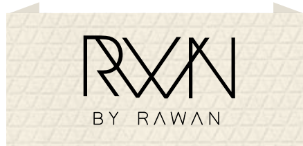
BOTTOMS MAIN LABEL woven quality, 2.25" x 1"