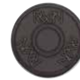
32L TACK BULLSEYE BUTTON -raised artwork