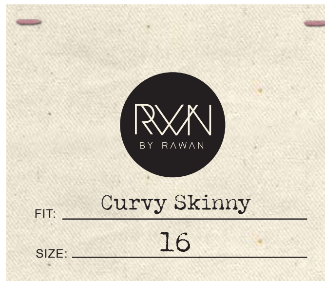
POCKET FLASHER 3.5" x 3"