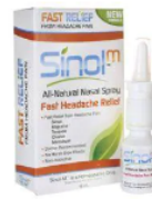
Sinol Sinol-M All-Natural Nasal Spray-- Fast Headache Relief