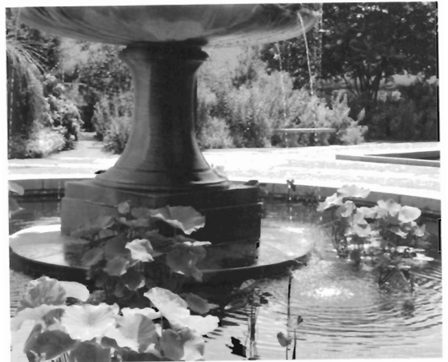
Brooklyn Botanical Gardens.