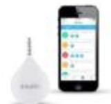
iHealth Align Gluco-Monitoring System BG1