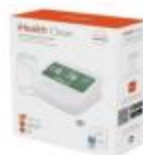
iHealth Clear Wireless Blood Pressure Monitor