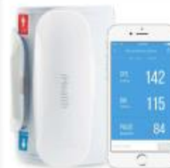
iHealth Lab Inc - Wireless Blood Pressure Arm Monitor BP5, 1 ea