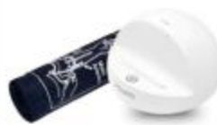
iHealth Ease Blood Pressure Monitor, Large Cuff