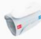
iHealth Feel Wireless Monitor