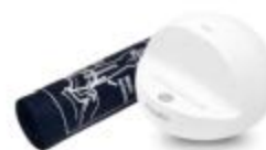
iHealth Ease Blood Pressure Monitor, X-Large Cuff