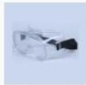
Livocare Protective Safety Goggles