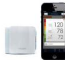
iHealth BP7 Wrist Blood Pressure Monitor