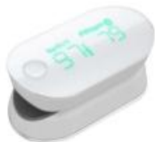
iHealth Air PO3M Pulse Oximeter