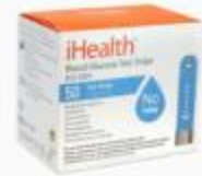
iHealth Blood Glucose Test Strips