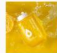
Simpleway Automatic Foaming Soap Dispenser Refill