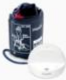
iHealth Ease Wireless Monitor