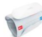
iHealth Feel Wireless Arm Blood Pressure Monitor, XL Cuff 16.5" - 18.9"