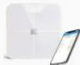
iHealth Nexus Wireless Body Composition Scale