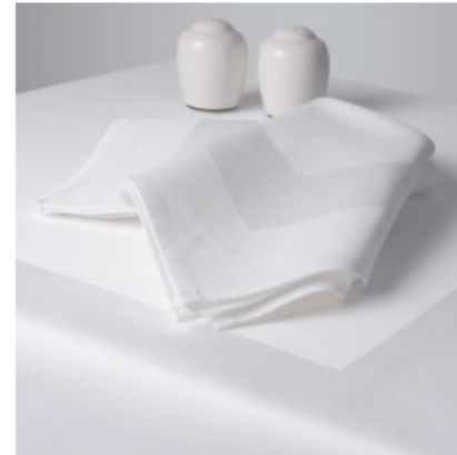
SATIN BAND - COTTON / POLY BLEND