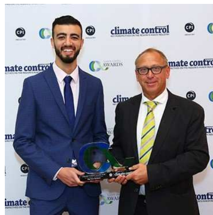
Big Foot Systems Wins Innovation Award at Climate Control Middle East Awards

(/big-foot-systems-launches-the-time-saving-lock-n-load-ac-frame)