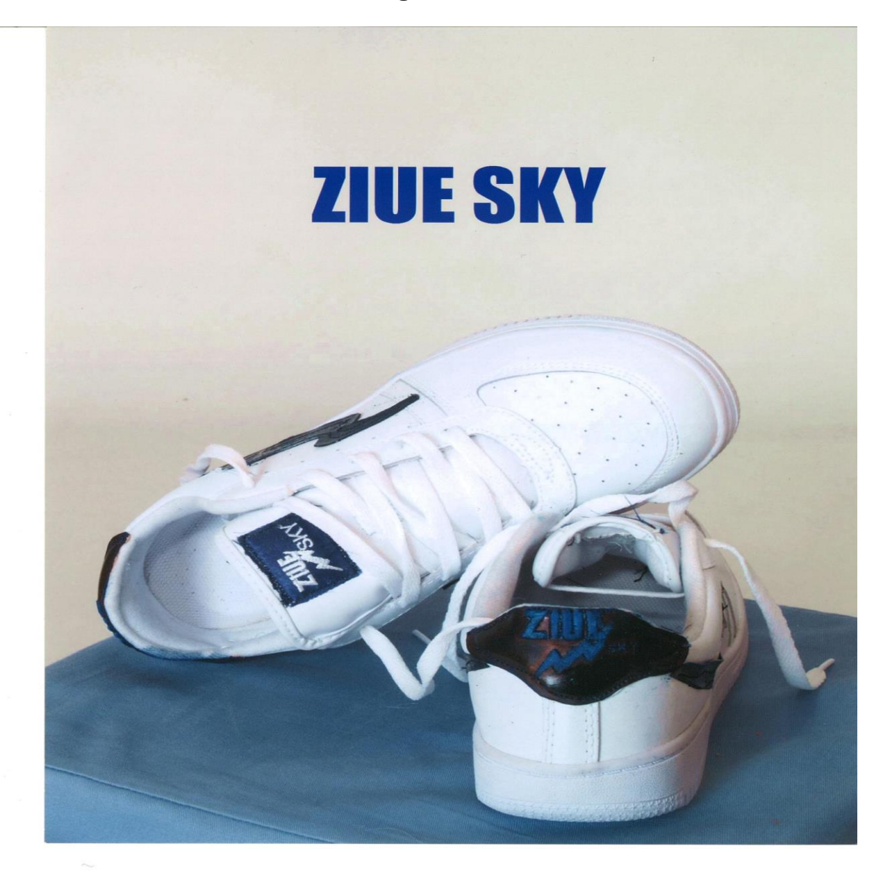
Exhibit 1 – Registrant Mark 611