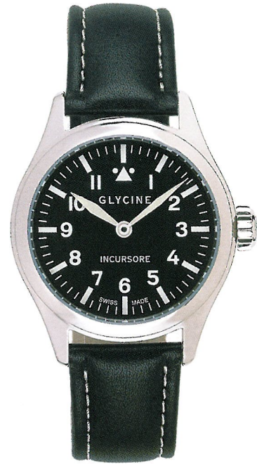
3762.19ATP-LB9 manual winding UT 6497 GENEVA finish stainless steel case sapphire crystal see-through back with sapphire crystal 100m