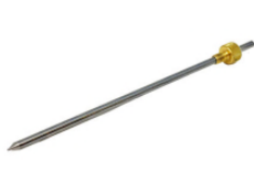
11/64" Inlay Cutter 0.040