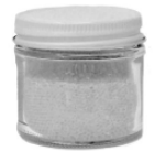
Clear Acrylic Raster® Spheres (10,000)