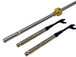
1/4" x 6.5" Collet Drill Assembly