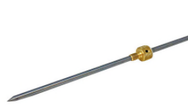
11/64" Profile Cutter 0.010