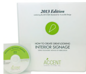
Interior Signage Manual