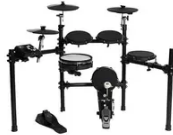
Lemon T500SE mesh head digital drum set 8-piece...