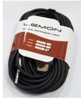
Lemon instrument cable 1/4" plug