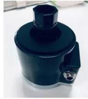
LEMON Hihat Sensor Trigger