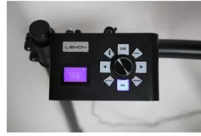
LEMON T500 Electronic drum sound module