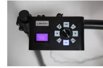
LEMON T500 Electronic drum digital drum sound...