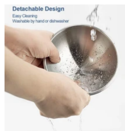
Detachable Design Easy Cleaning Washable by hand or dishwasher