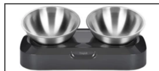
Food Grade 304 Stainless Steel