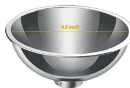
Protect your pet health