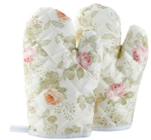
Hudgan Household barbecue... US $8.10