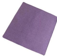
hanpiu Chess and card tablec... US $16.10