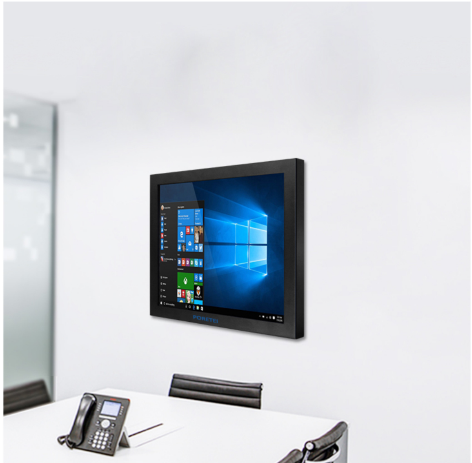
PORETEI Flat panel display screens