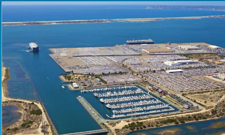
PASHA- PORSCHE AUTO PROCESSING FACILITY — CHULA VISTA, CA General Contractor - Arco National Construction Company 26,400 Sq. Ft. Facility, Office & Production, Complete VRF System and Multi-Use Ventilation