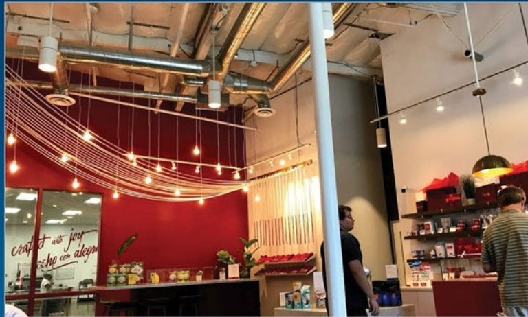
CHUAO CHOCOLATIERS FACTORY — CARLSBAD, CA General Contractor - White Construction 23,500 Sq. Ft. Production Facility, Offices, Kitchen Ventilation and Fully Air Conditioned Storage