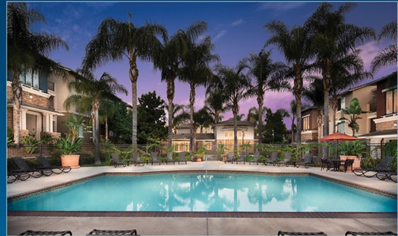
HERITAGE PARK — CHULA VISTA, CA General Contractor - Katerra Complete HVAC Renovation of (193) Assisted Living Units and (180) Apartment units