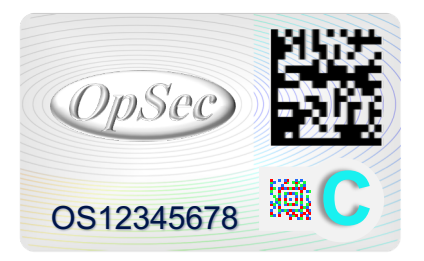
0.6 inch x 1.0 inch