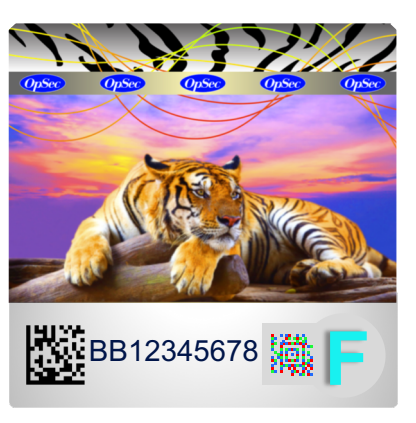
1.0 inch x 1.0 inch