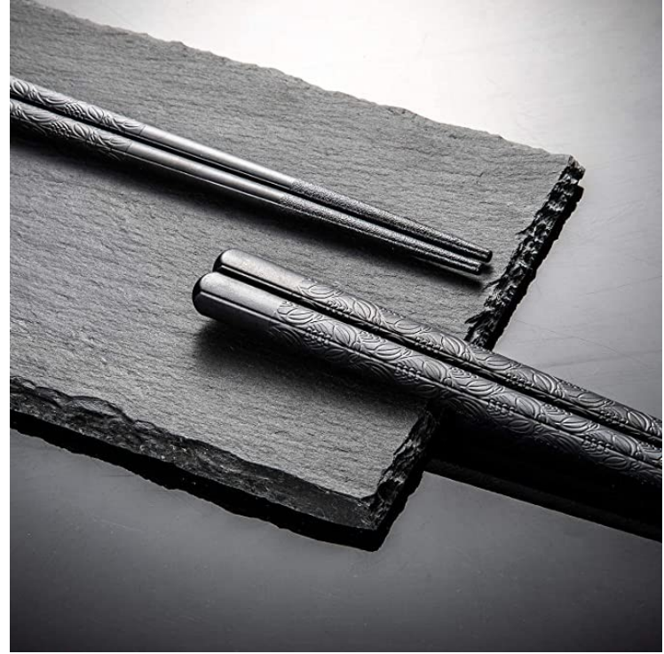
Roll over image to zoom in