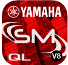
QL StageMix - US Music