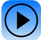
iMIX16 Go Music