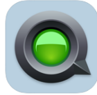
QLab Remote Utilities