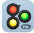
Go Button Pro Music