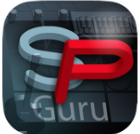
StagePlot Guru Music

More ways to shop: Find an Apple Store or other retailer near you. Or call 1-800-MY-APPLE.