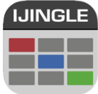
i-jingle 2.0 Music