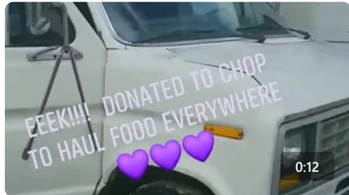
Look what we had donated! We are so in...