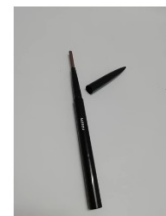
ALESOU Automatic Waterproof Eyebrow Pencil (Dark Brown)