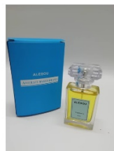
ALESOU Forever Eau de Parfum Perfumery