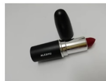
ALESOU Premium Lipstick Tint Stick Dark Red