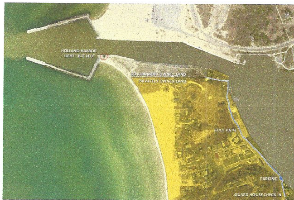
Overhead View of Pedestrian Access points to Bi...

The gatehouse will be staffed weekends during May; this includes the weekends of Tulip Time. There will be an opportunity to park within the gate at that time.