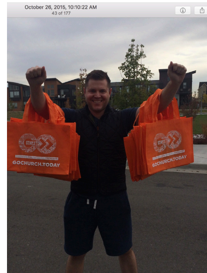
Public Distribution, Oct. 2015, slogan in use.