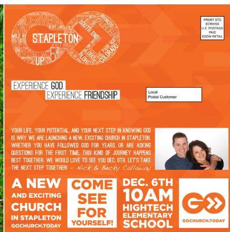
Public mailer through USPS Dec. 6th, 2015