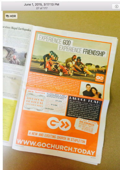
Newspaper ad, June 2015, slogan, and mission are in use, white logo on orange background.