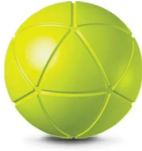
HI.PER(R) LITE FOAM