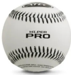
HI.PER(R) PRO LEATHER