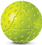
HI.PER(R) X-ACT DIMPLE