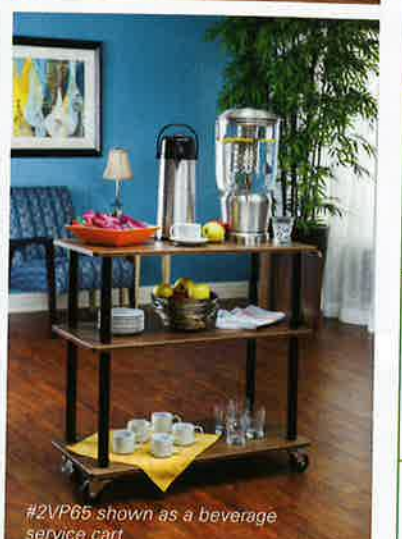
#2VP65 shown as a beverage service cart