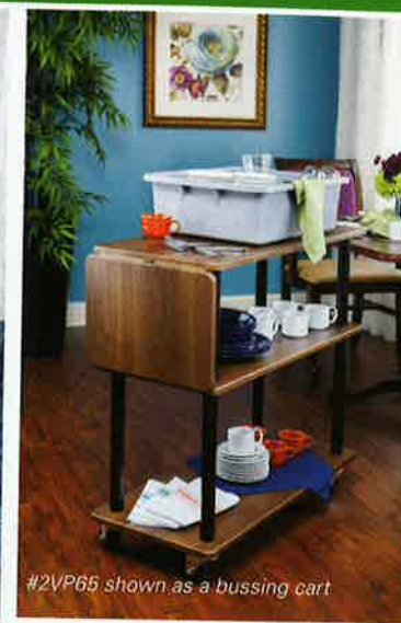
#2VP65 shown as a bussing cart