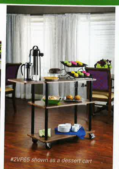
#2VP65 shown as a dessert cart