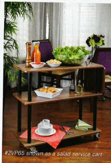
#2VP65 shown as a salad service cart