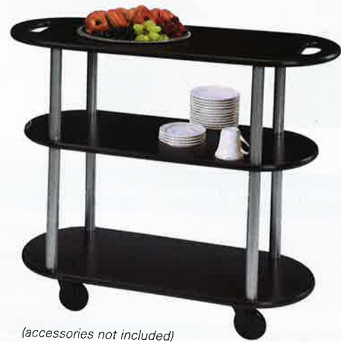
(accessories not included)