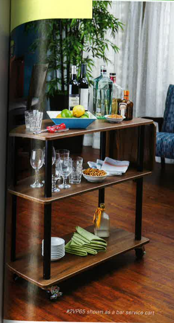
#2VP65 shown as a bar service cart