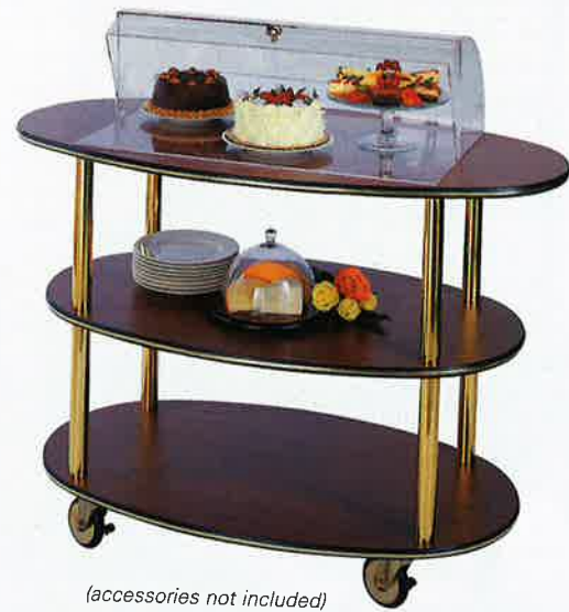
(accessories not included)