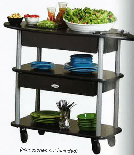
(accessories not included)