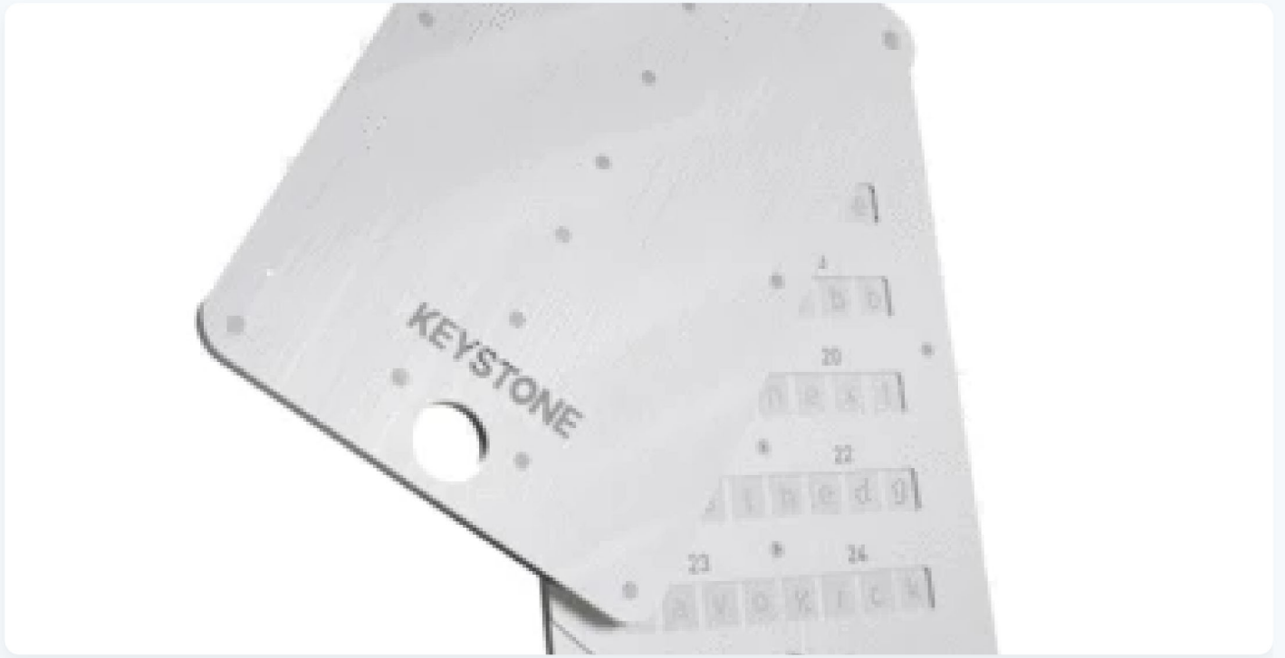
Keystone Tablet Plus