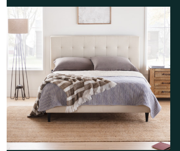
New Furniture Releases