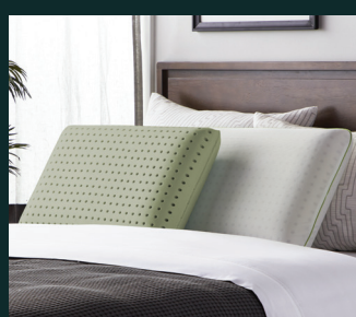
Expanded CBD Assortment