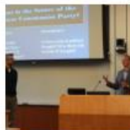
The Pre-conference Workshop: "Scenarios for China's Future"