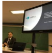
Concept Paper: The Role of BRICS in Global Governance and International Law