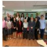
FLIA Seminar at Instituto de Política Pública e Relação Internacional - UNESP