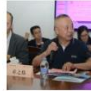
Panel 3 The Social Credit System and Global Governance