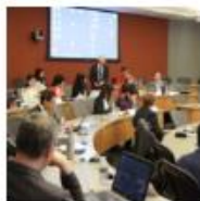
Opening Remarks on April 22

From April 21-23, The Foundation for Law and International Affairs, Manchester University Alliance Manchester Business School Business and Human Rights Catalyst, The Coalition for Peace and Ethics, The Pennsylvania State University Center for Global Studies, Penn State Law, the Penn State School of International Affairs, and The Penn State University Research and Career Development Network for Law and International Affairs hosted the international conference "New International Trade and Investment Rules between Globalization and Anti-Globalization." Featured guest speakers from China, the US, the UK, Italy, Denmark, and Hong Kong attended the conference. The conference included a pre-conference workshop, four panels, and one special session.