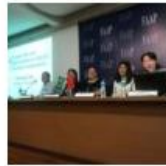
FLIA Seminar at Fundação Armando Alvares Penteado