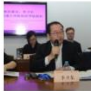
Panel 4 Social Credit and the Market Economy