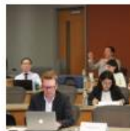
Keynote Speech: Accounting for Human Rights in International Trade