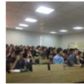
BRICS Cooperation: Facing International Changes together, Pursuing Mutual Benefit and Win-Win Result