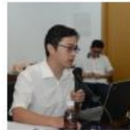
Panel 5 Personal Data Protection in the Social Credit System