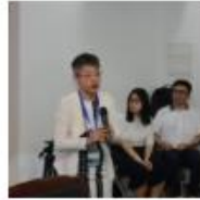
Panel 1 Social Credit Legislation: The Status Quo and the Future