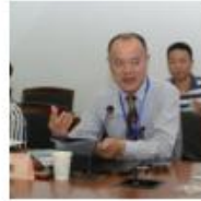
Panel 2 The System and Practice of Credit in the Global Context