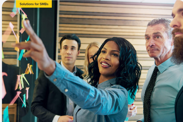
Solutions for SMBs