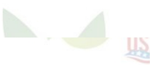
NakedCBD Relief Balm (500mg)