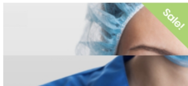
50 PK – Disposable Flexible 3-Ply Face Mask (String Loop)