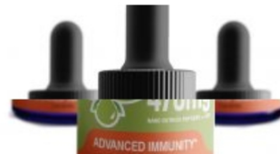
CBD Immune Buddy