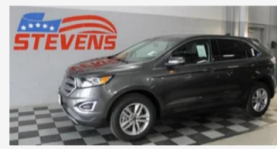
2018 Ford Edge SEL