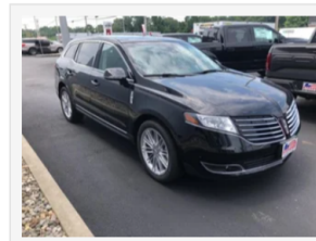
2018 Lincoln MKT Reserve