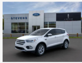
2019 Ford Escape SE DEMO