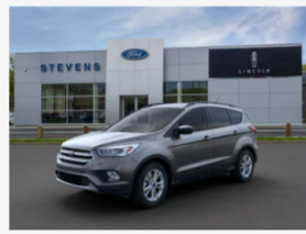
2019 Ford Escape SEL