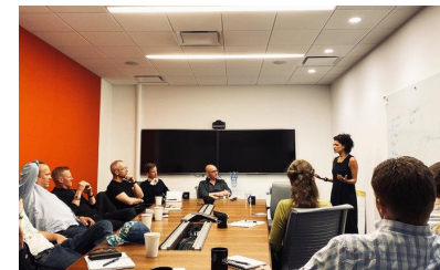
TINC Fall 2019 - Truly Understand Scaling Oct 30, 2019