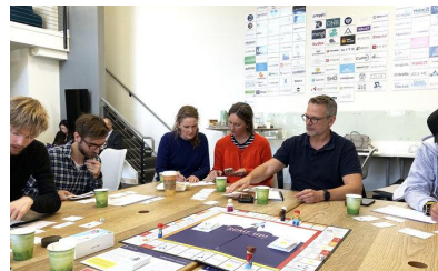
Land, Crash and Learn! - TINC Fall 2019 Nov 5, 2019