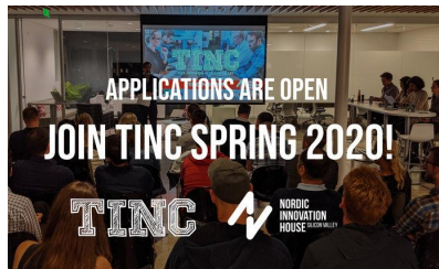
Don't TINC! Just do it! Nov 22, 2019