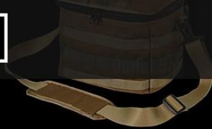
The Mess Deck Lunch Bag