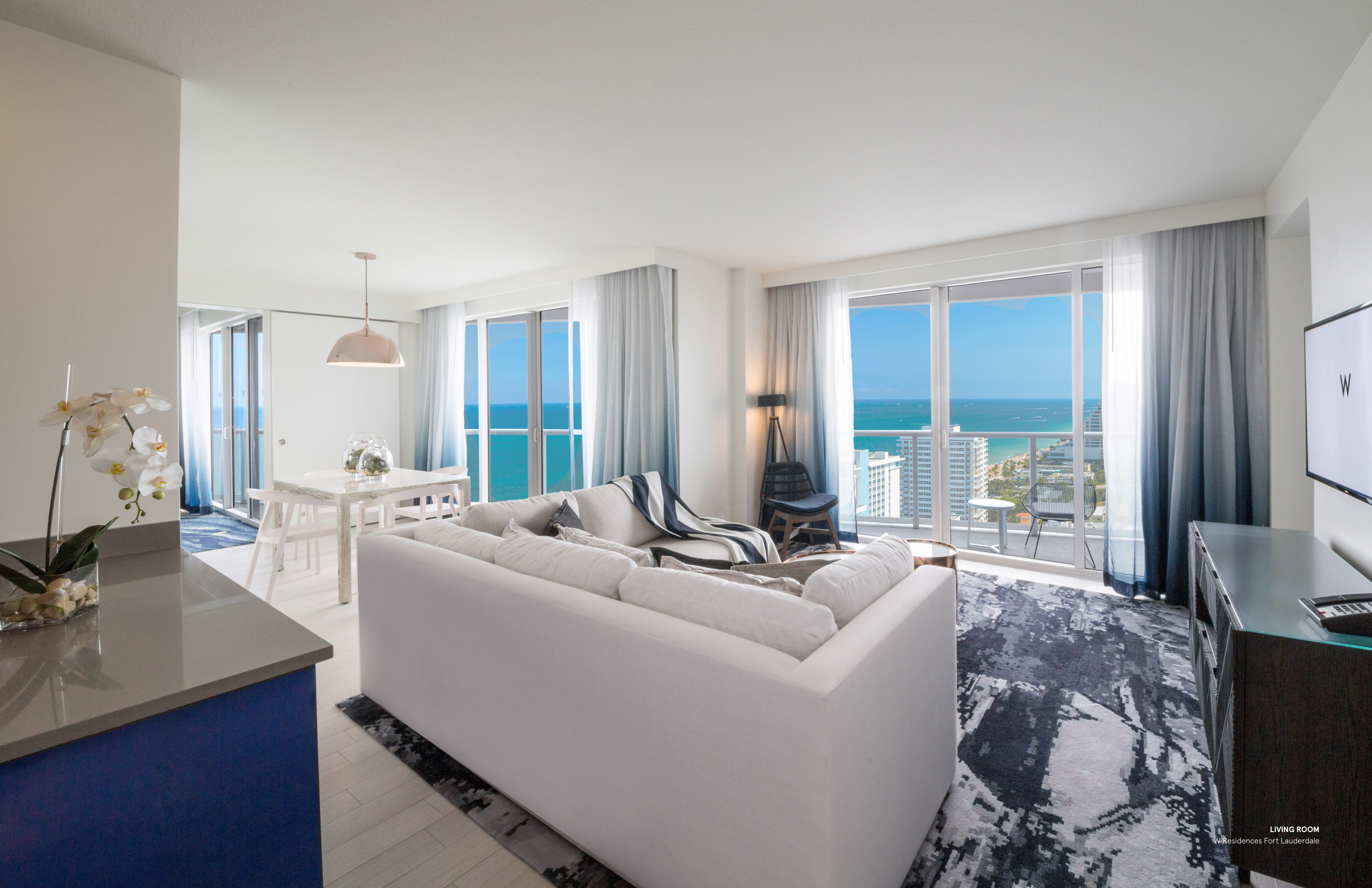
LIVING ROOM W Residences Fort Lauderdale