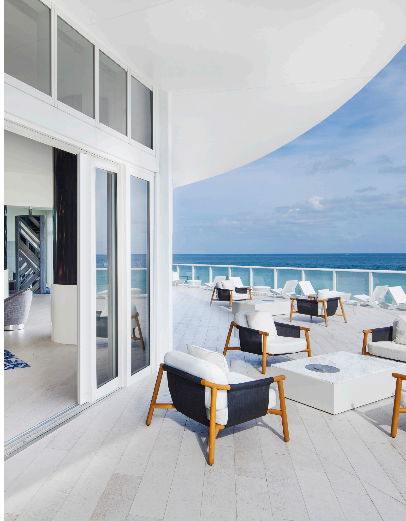
LIVING ROOM TERRACE W Fort Lauderdale

A world of benefits and privileges awaits. Customized Italian cabinetry, polished stone countertops and spacious seating anchor each home's fully integrated kitchen. Immerse yourself in spa-styled jacuzzi baths and indulgent W hotel beds found in every master suite. You'll marvel at unobstructed ocean and city views from plush private balconies. These finishing touches infuse the residences with W Fort Lauderdale's signature elegance and comfort. Spa services, dedicated welcome ambassadors, a fitness center and oceanfront dining are all within this convenient complex. Live an edenic existence where the only limits are your dreams and imagination.