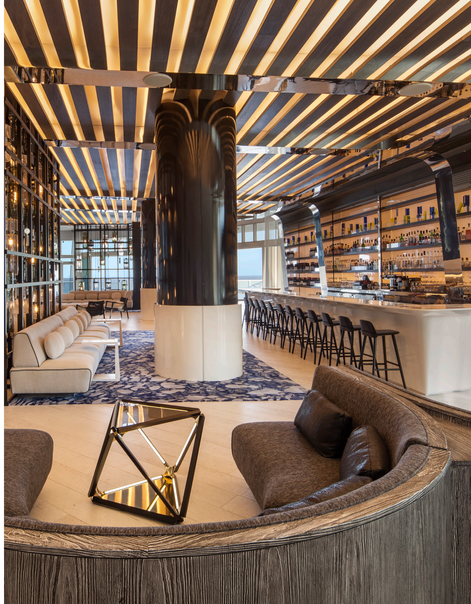
LIVING ROOM W Fort Lauderdale

and to hotel groups like W Hotels and St. Regis. No doubt, they favor Meyer Davis' focused-yet-luxurious aesthetic, which is defined by warm colors, clean lines and an unwavering commitment to beauty and functionality. Meyer Davis enjoys seeking new and unexpected solutions, values lasting impact over flash, and believes in the power of restraint. Their work proves that intelligent subtraction often yields the greatest results.