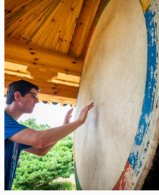
Residency and Tour