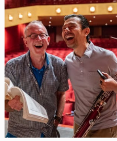
Guest Artists and Faculty