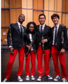
Meet the Orchestra