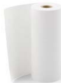
Summit Doppler ABI Label Printer Paper 5/Rolls