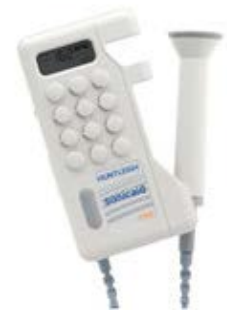
Huntleigh Fetal Dopplex II 2MHz Doppler W/ Probe