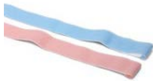
Fetal Monitoring Strap Sets, 48", 50/Cs