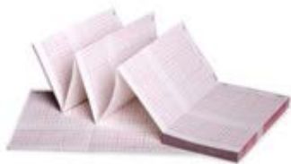
Fetal Monitoring Chart Paper, Z-Fold, 152 Mm X 47", 40/Case