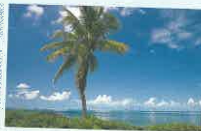
SIMULATED WITH COSTA 580™ LENS