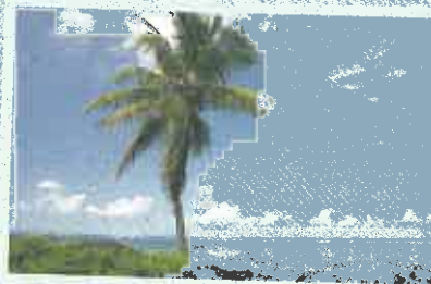
STANDARD SUN LENS