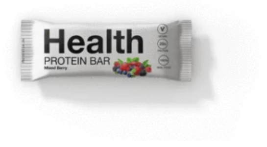
Mixed Berry Protein Bar $27.99

\leftarrow \ \ \mathsf{BACK} \ \mathsf{TO} \ \mathsf{NUTRITION}