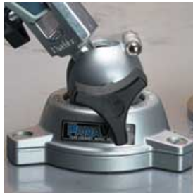
Click on any of the above images to find out more about the products pictured.