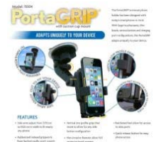
PortaGRIP Features View larger

Founded in 1956, PanaVise Products, Inc. is a world leading manufacturer of high quality precision work holding tools, CCTV camera mounts, action sports camera mounts and mobile electronics mounts and accessories. PanaVise also offers expert OEM/ODM custom mount design and production capabilities for some of the world's most well-known consumer electronics brands. PanaVise designs and engineers its "innovative holding solutions" at its headquarters in Reno, Nevada USA. Manufacturing occurs at PanaVise facilities in Reno and Changzhou.