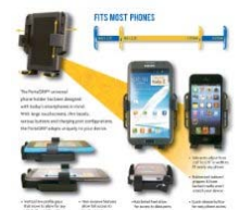
PortaGRIP Versatility View larger