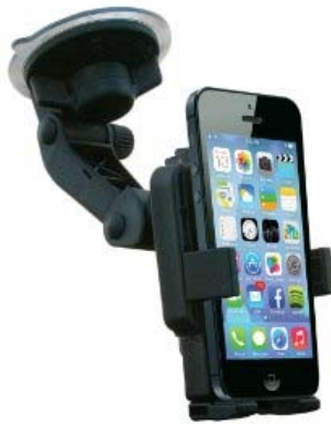
PanaVise PortaGRIP Model: 15504 View larger