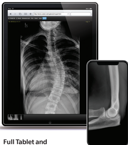
Full Tablet and Smartphone Access