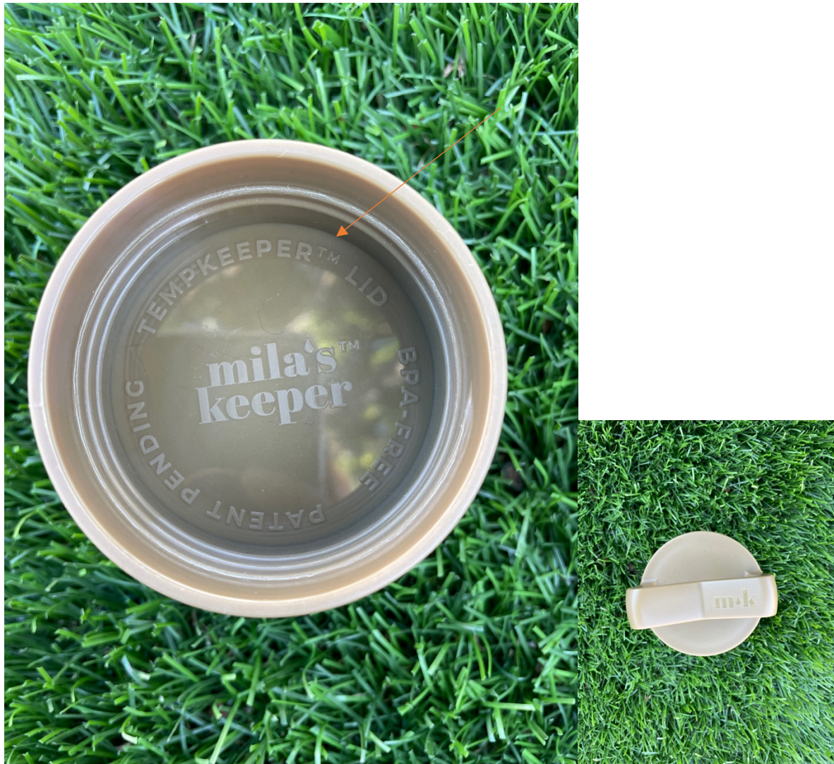
Image of mark used inside reusable self-sealing lid of containers and the storage of food, bottles, sold empty, portable coolers, non-electric cooler, heaters for feeding bottles, reusable stainless steel water bottles, and vacuum bottles.

CLASS 021 for Bottles, sold empty; Portable coolers, non-electric; Reusable self-sealing lids for household use for bowls, cups, containers and the storage of food; Dewar bottles and vessels; Drinking bottles for sports; Heaters for feeding bottles, non-electric; Non-electric portable coolers; Non-electric portable beverage coolers; Non-electric heaters for feeding bottles; Reusable stainless steel water bottles sold empty; Vacuum bottles