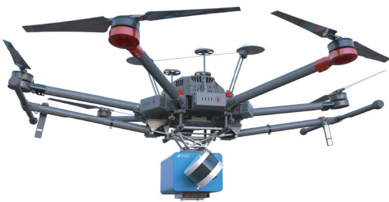
Pivot shown on example vehicle. We can help integrate the Pivot with other aircraft and systems.