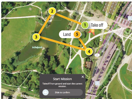
Mission planning software