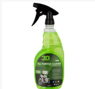
All Purpose Cleaner 24 oz