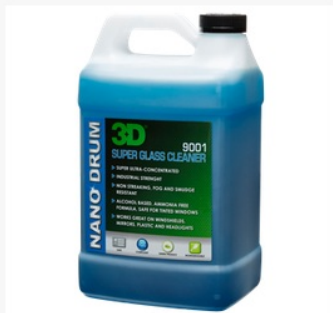
Super Glass Cleaner