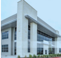
Texas Distribution Center