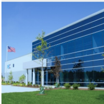
Hudson, OH Corporate Headquarters, Distribution Center