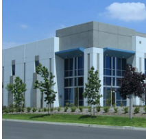
California Distribution Center