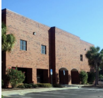
Florida Distribution Center