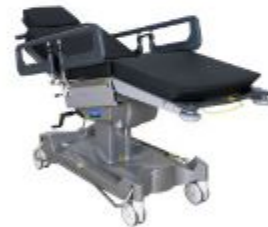
DRE Versailles P100 Powered Mobile Surgery Table