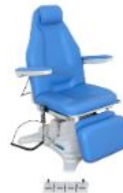
Avante Milano E20 Power Procedure Chair