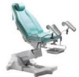
Avante Milano OB20 OB/GYN Procedure Chair

All product and company names are trademarks of their respective holders. Use