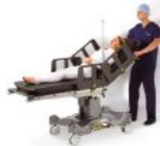
DRE Versailles M75 Surgical Stretcher