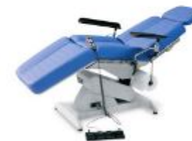
Avante Milano T50 Power Procedure Table